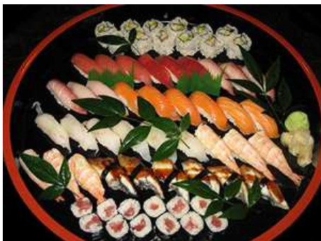
Sushi Platter (60pcs.) $99.00

Tuna, Yellowtail, Salmon, Flounder, Eel, Shrimp, California & Tuna rolls