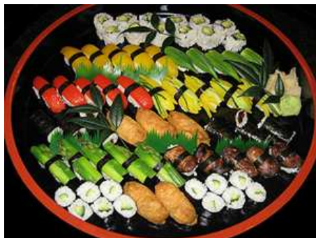
Vegetable Sushi Platter $59.00

Asparagus, Shiitake, Cucumber, Okura, Red Pepper, Yellow Pepper, Avocado & Kanpyo