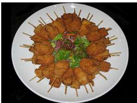
Fried Pork & Onion (35pcs.) $49.00