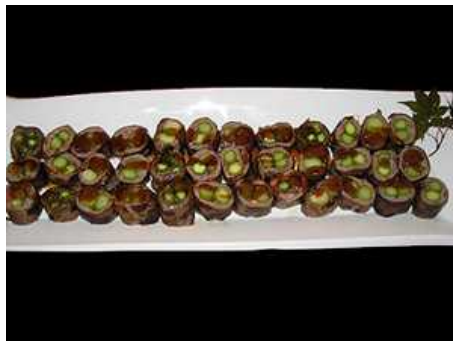
Beef w/Asparagus (30pcs.) $45.00