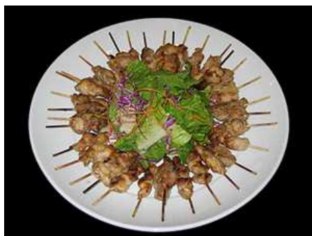
Yakitori (one bite size) (35pcs.) $30.00