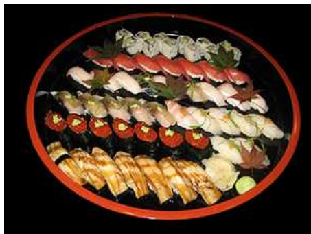
Deluxe Sushi Platter (54pcs.) $120.00

Tuna, Yellowtail, Aji, Anago, Flounder, Ikura & California roll